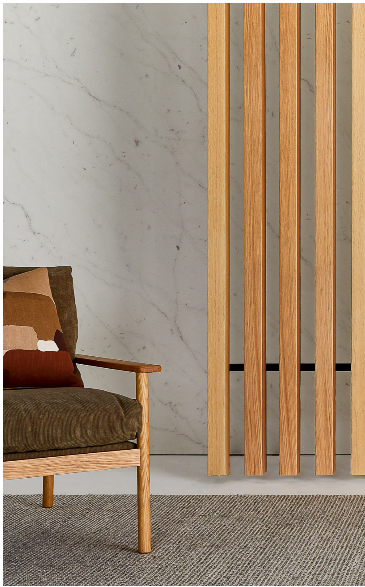
● Acoustic Timber Raft in W3 Oak