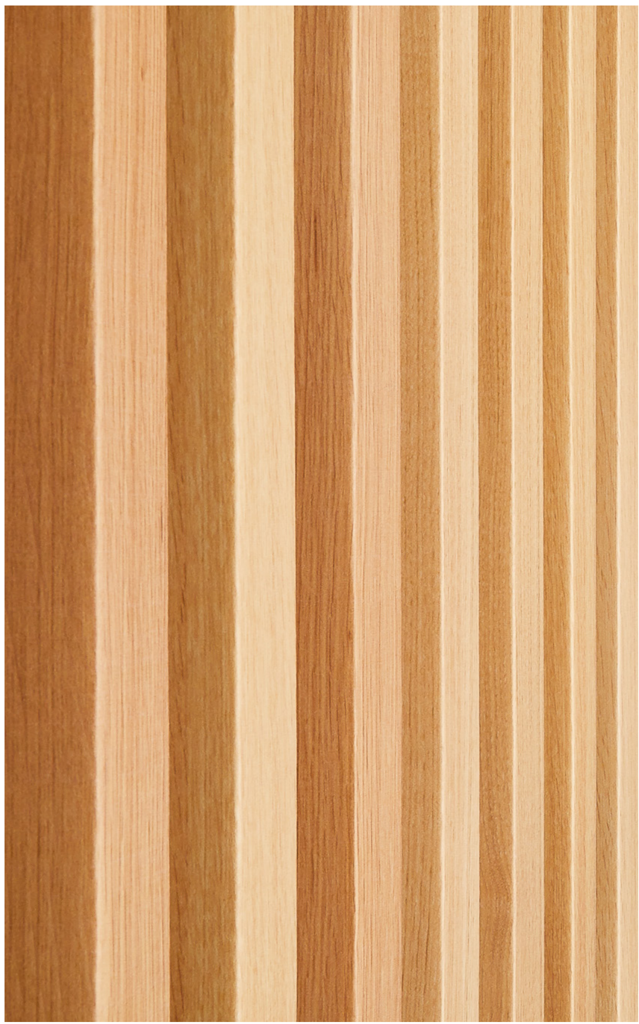
● Autex Acoustics, New Zealand